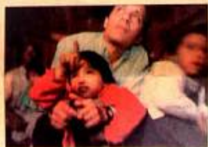
Regresó a escena cada domingo.