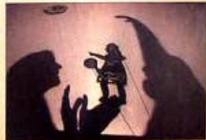
Presenta un aspecto de 'El Pueblo del Sol', última obra.