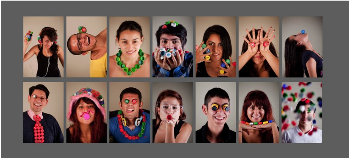
Students of the course Theory of Design.